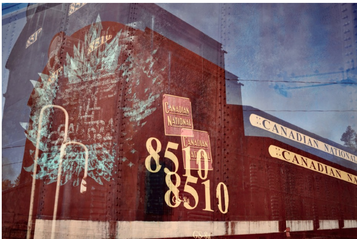
Machina - Tramen No. 20