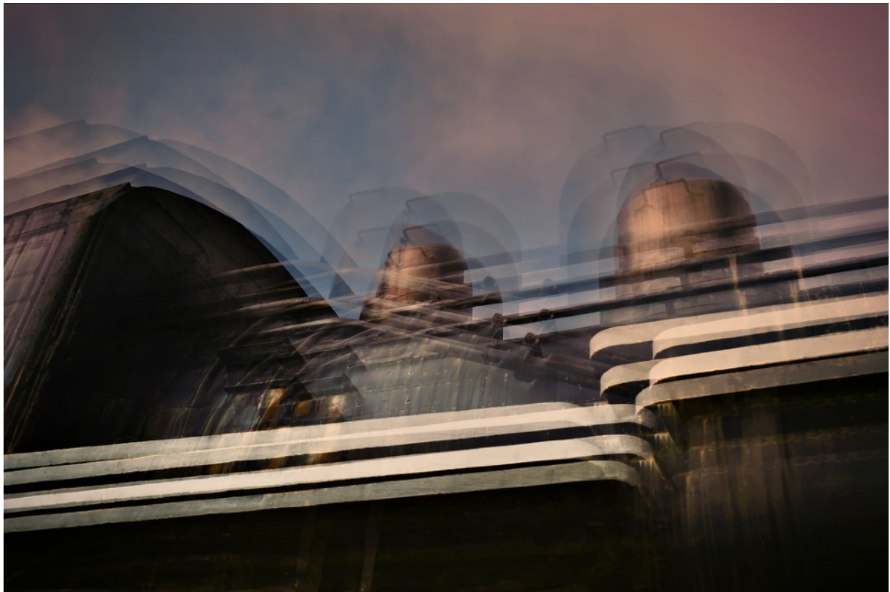
Machina - Tramen No. 13