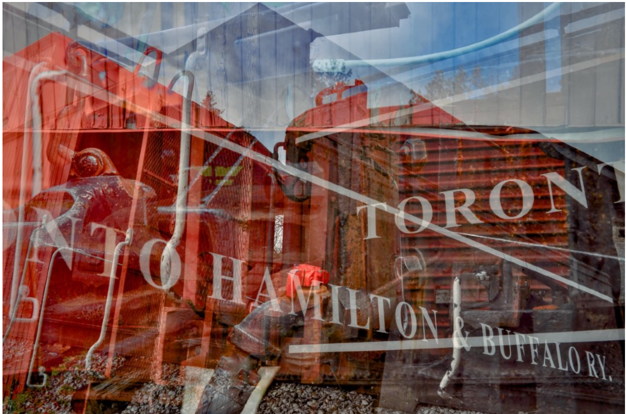
Machina - Tramen No. 18