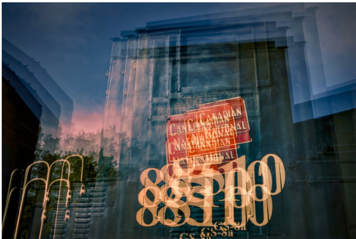
Machina - Tramen No. 16