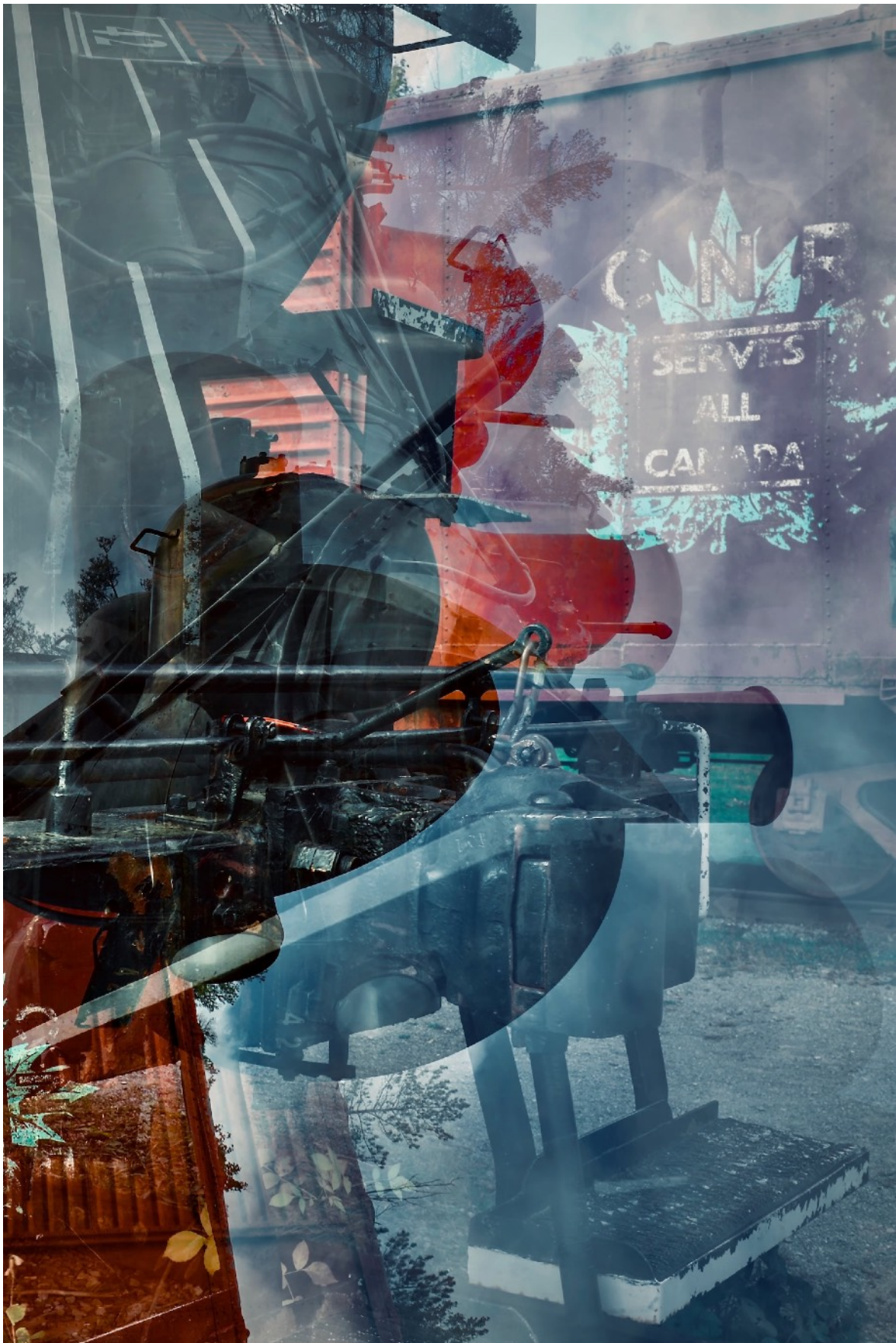
Machina - Tramen No. 8