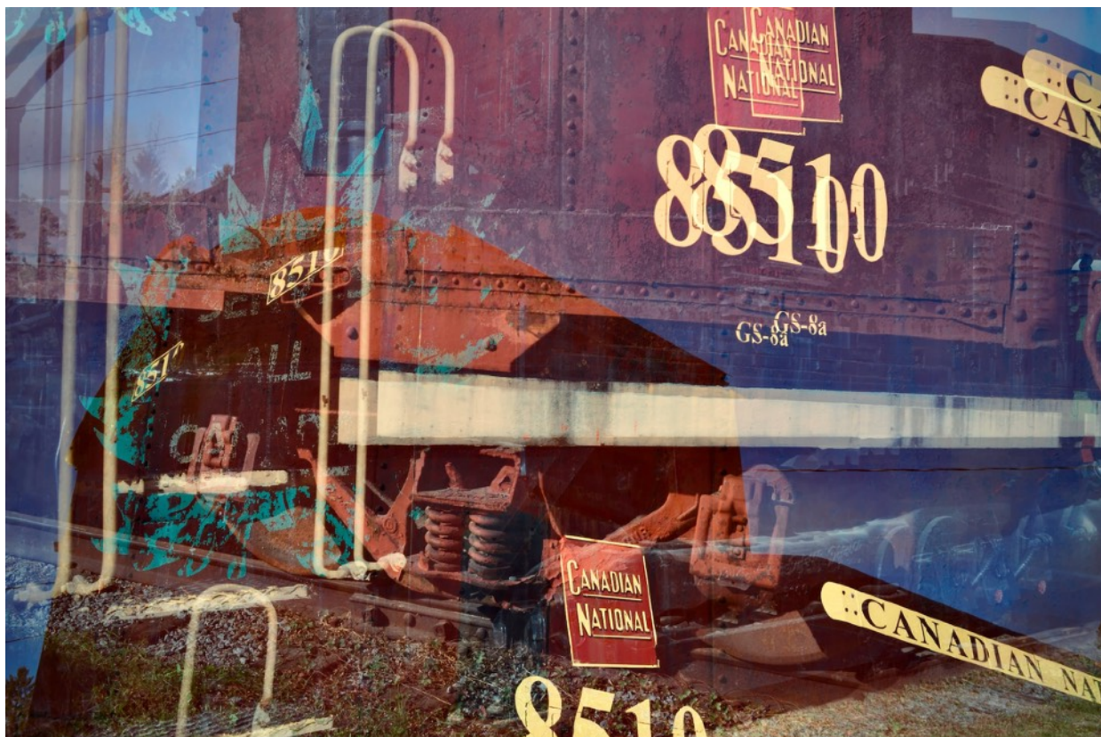
Machina - Tramen No. 19