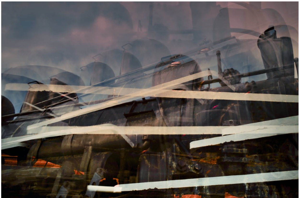
Machina - Tramen No. 14