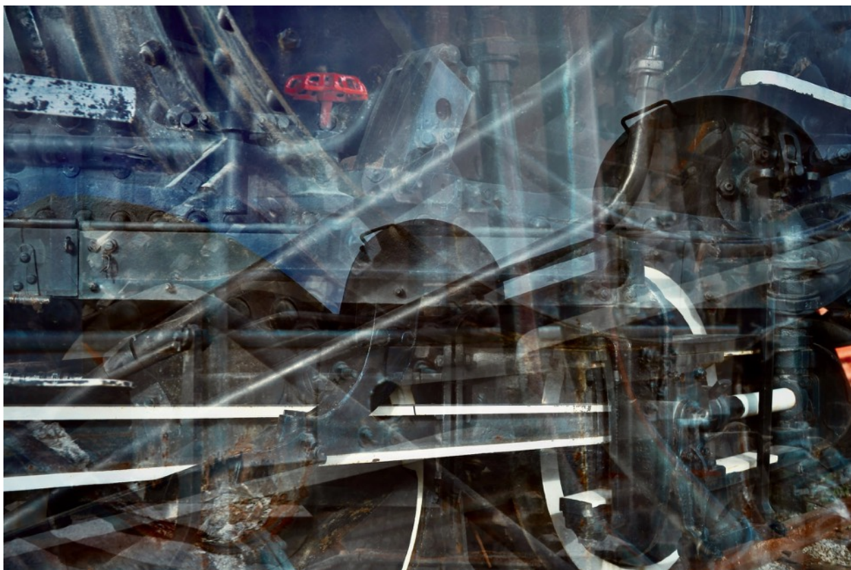
Machina - Tramen No. 4