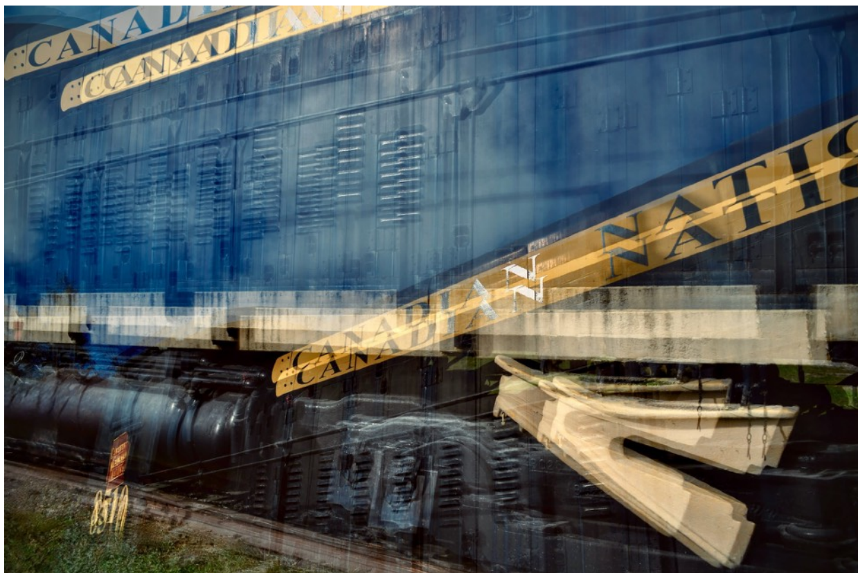
Machina - Tramen No. 10