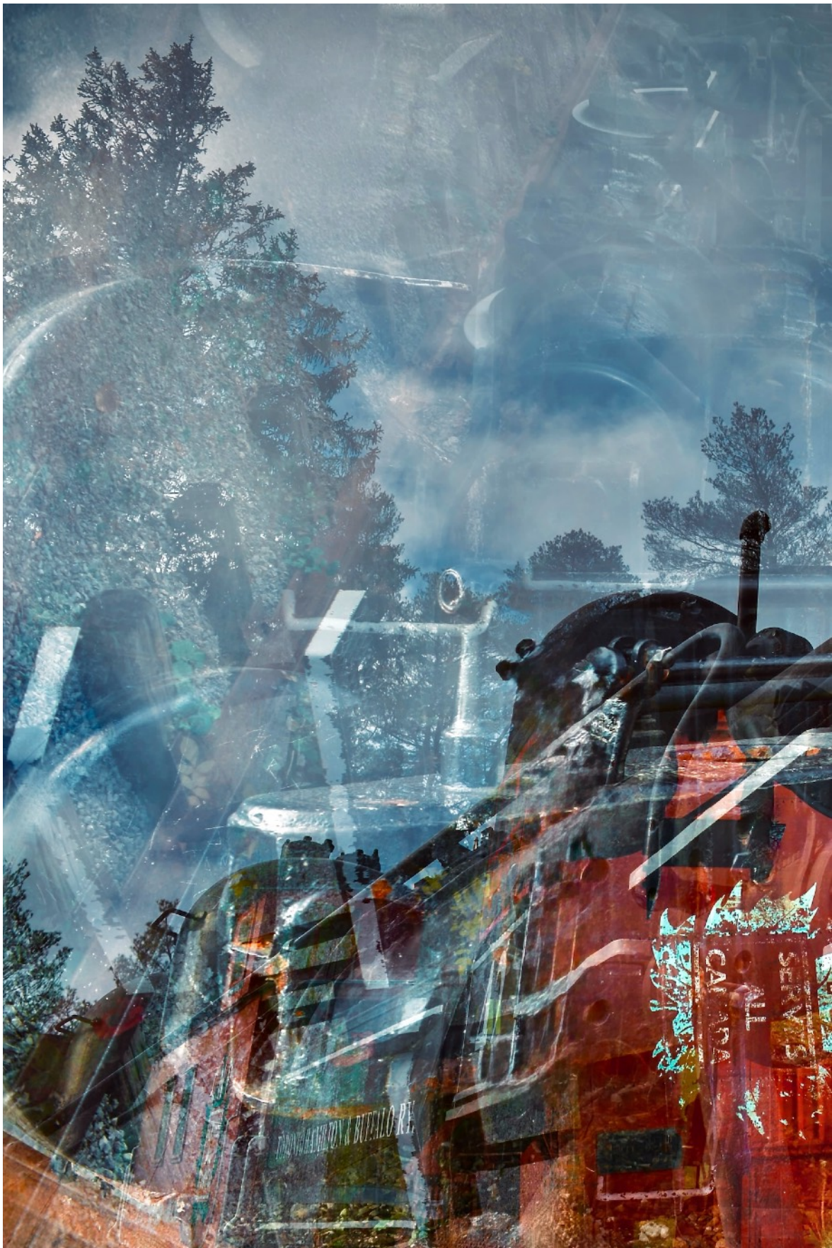
Machina - Tramen No. 7