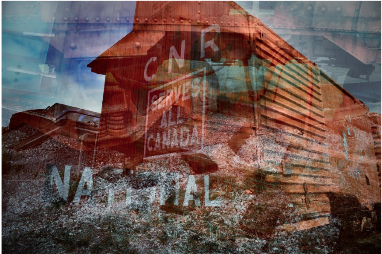
Machina - Tramen No. 17