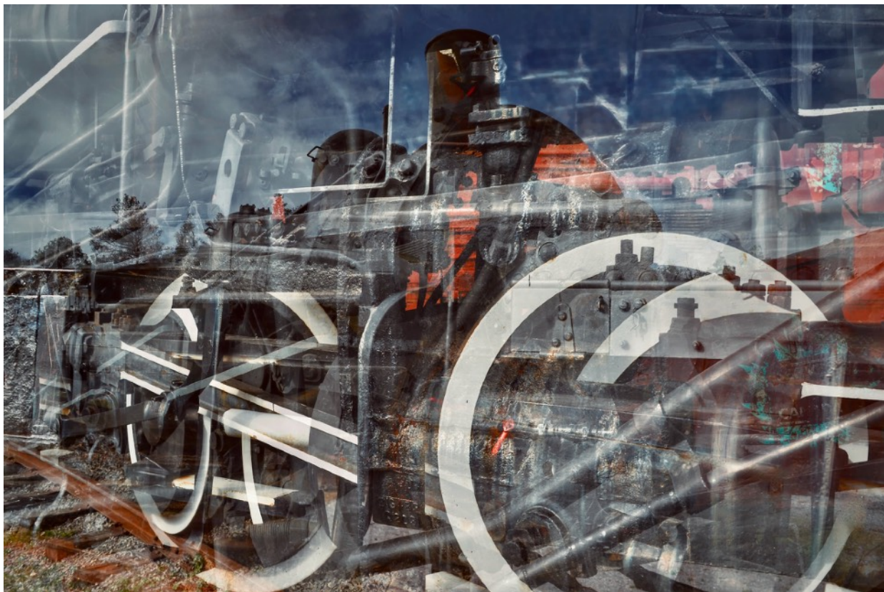
Machina - Tramen No. 3