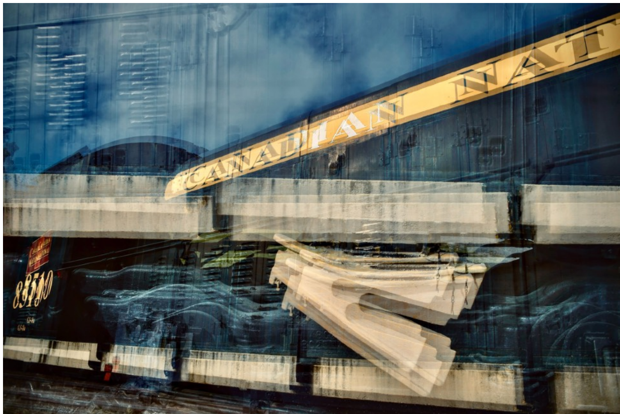
Machina - Tramen No. 11