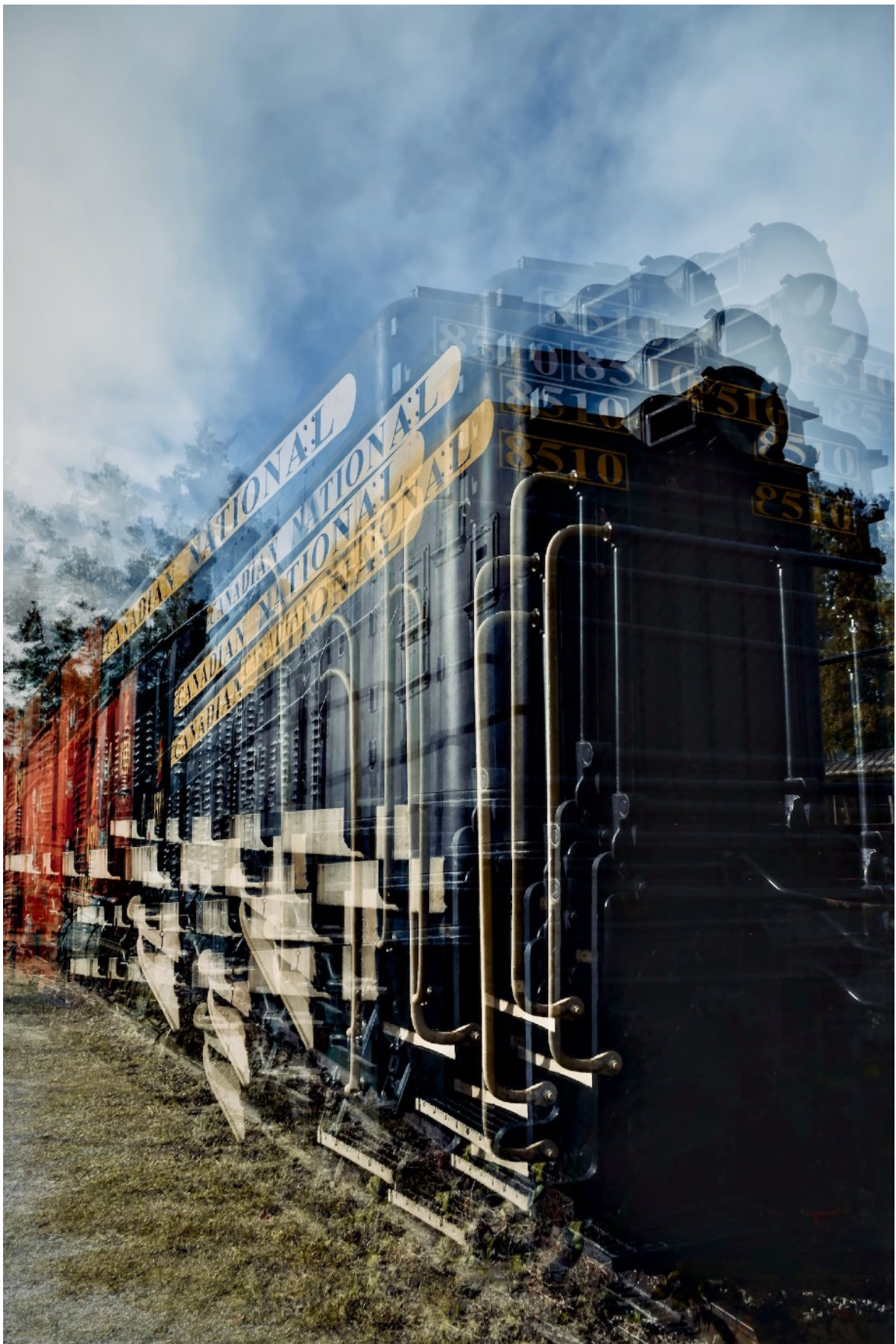
Machina - Tramen No. 1