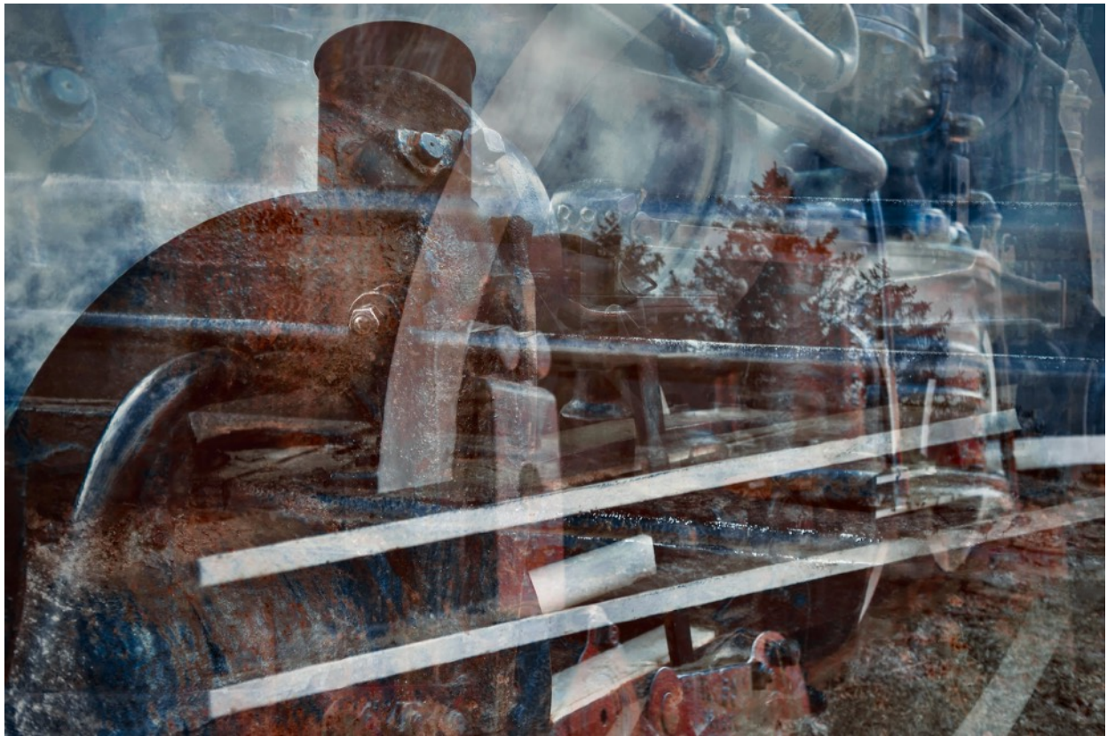
Machina - Tramen No. 5