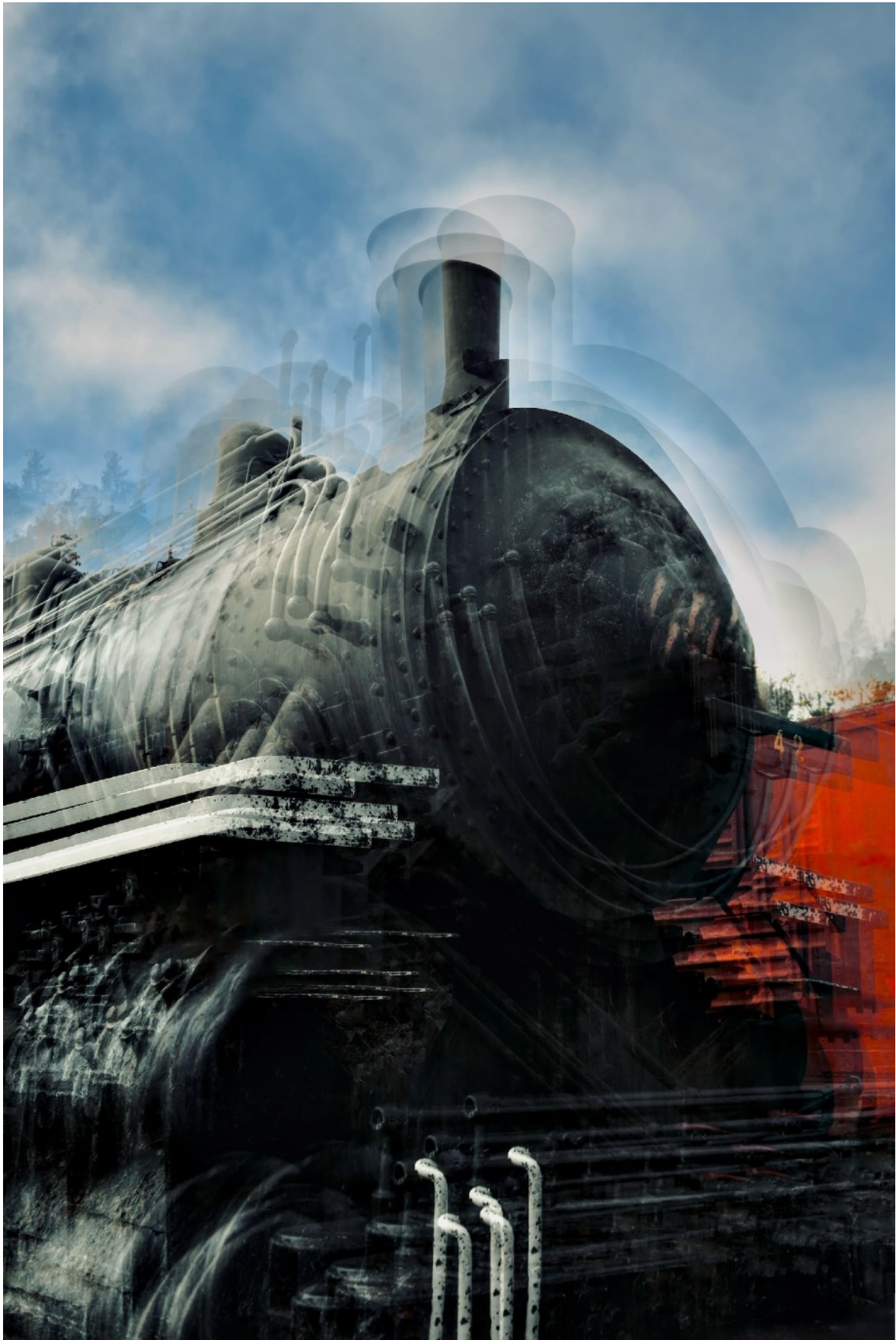
Machina - Tramen No. 2