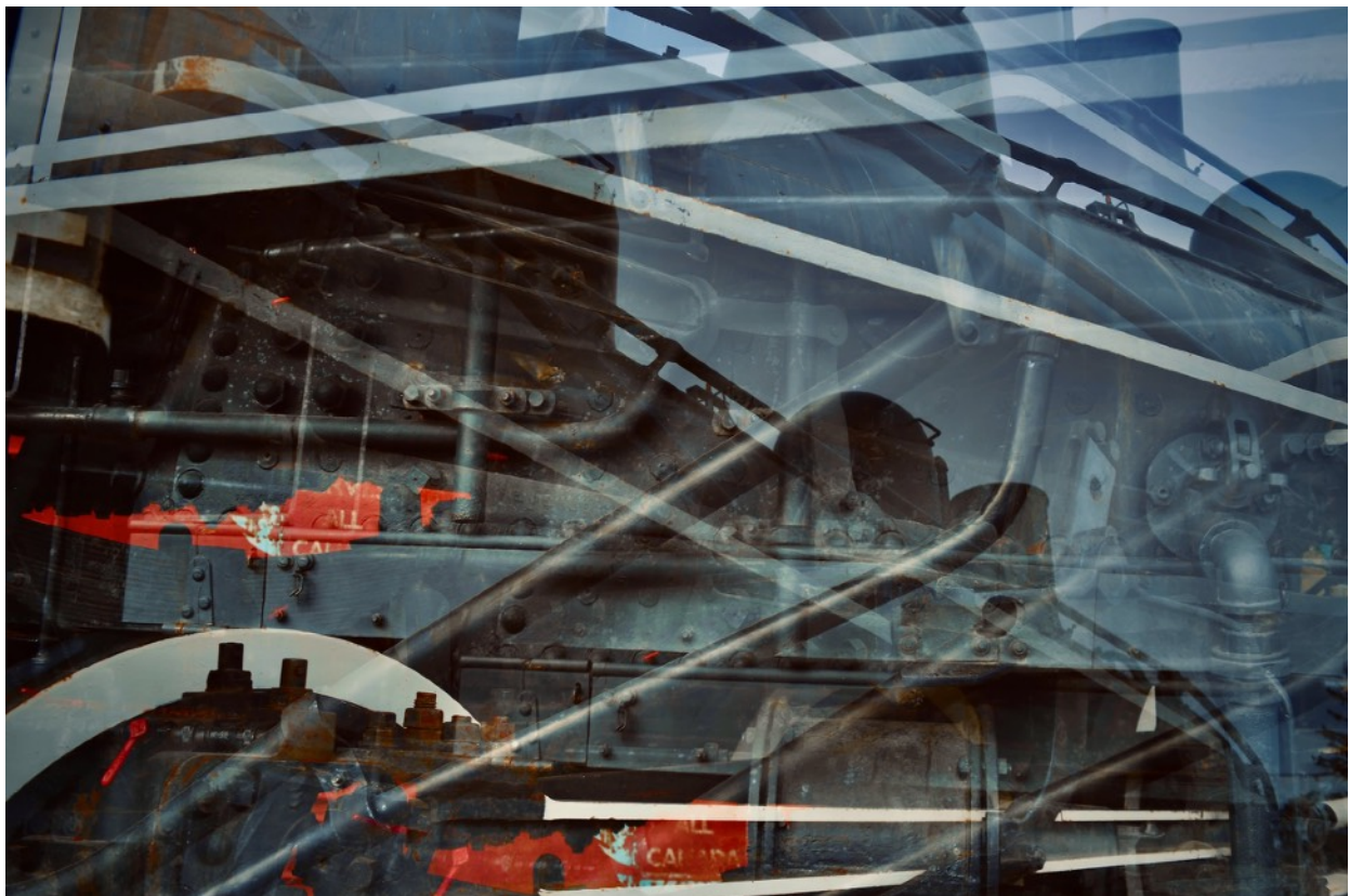
Machina - Tramen No. 6