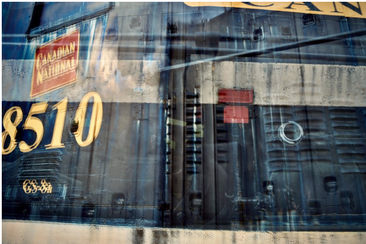
Machina - Tramen No. 9