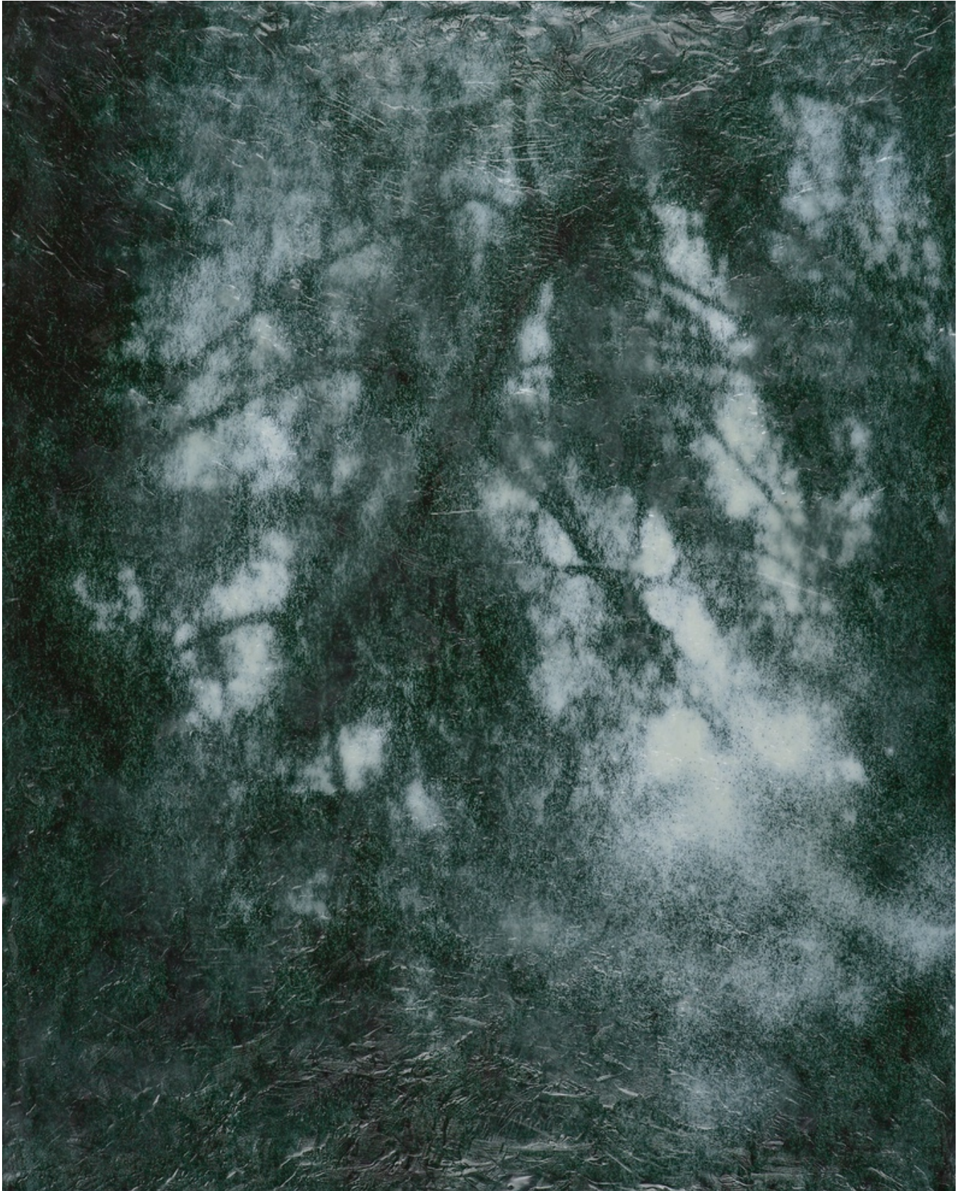
After the Wind No. 4

Ink, Watercolour, Wax on paper | 14 x 11 inches