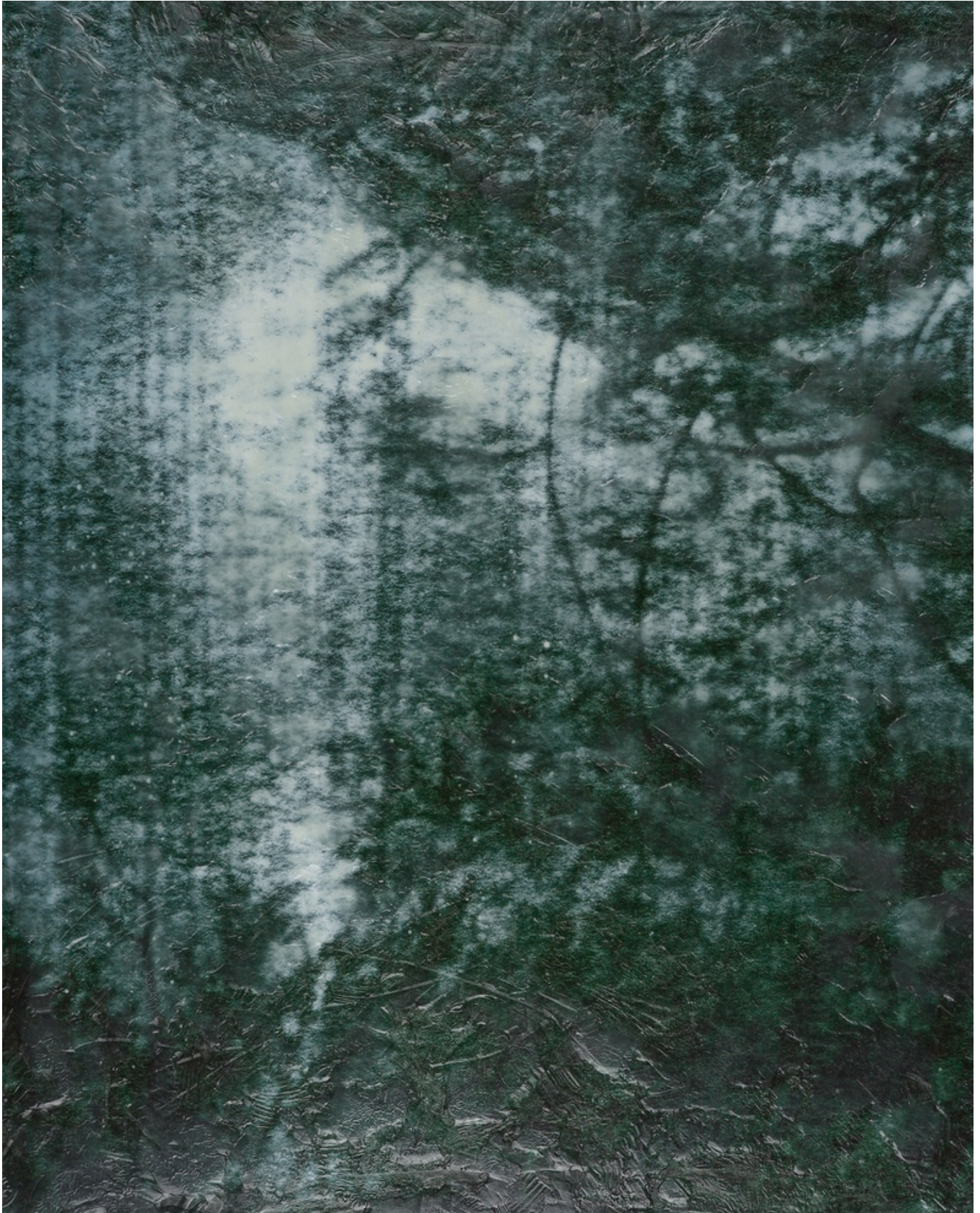
After the Wind No. 6

Ink, Watercolour, Wax on paper | 14 x 11 inches