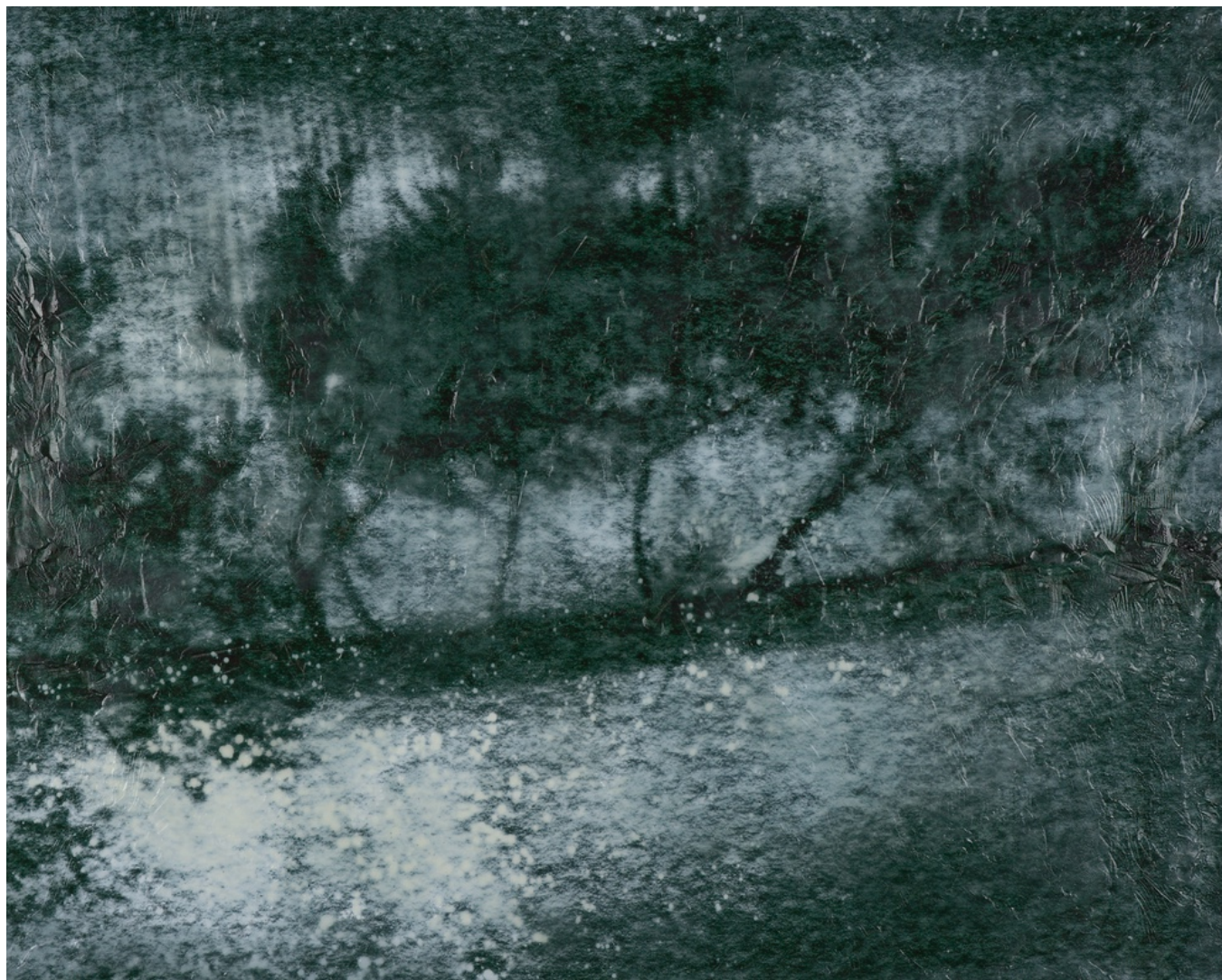
After the Wind No. 1

Ink, Watercolour, Wax on paper | 11 x 14 inches