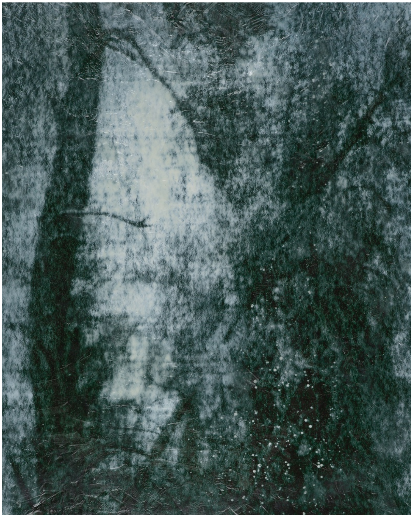
After the Wind No. 7

Ink, Watercolour, Wax on paper | 14 x 11 inches