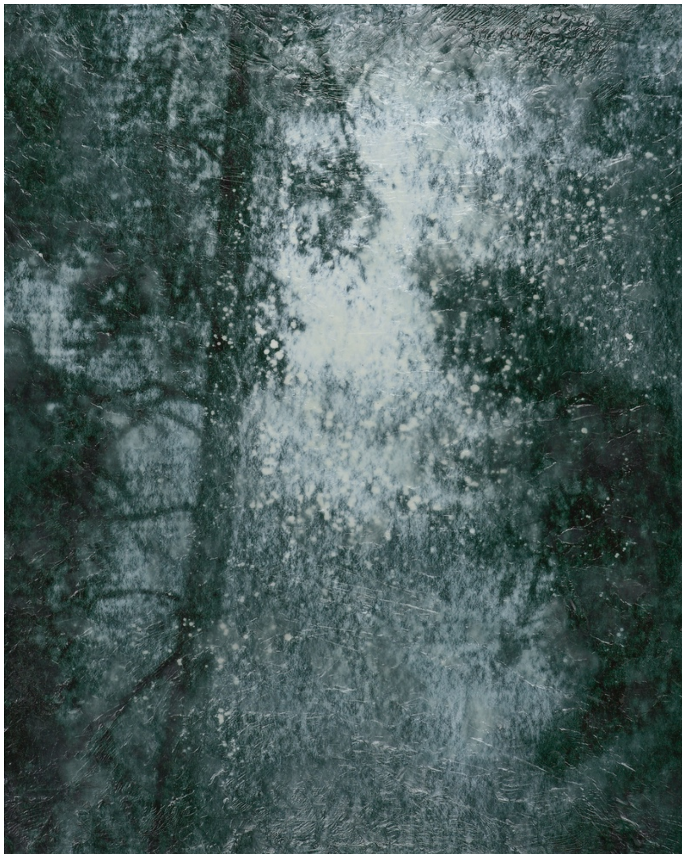
After the Wind No. 5

Ink, Watercolour, Wax on paper | 14 x 11 inches