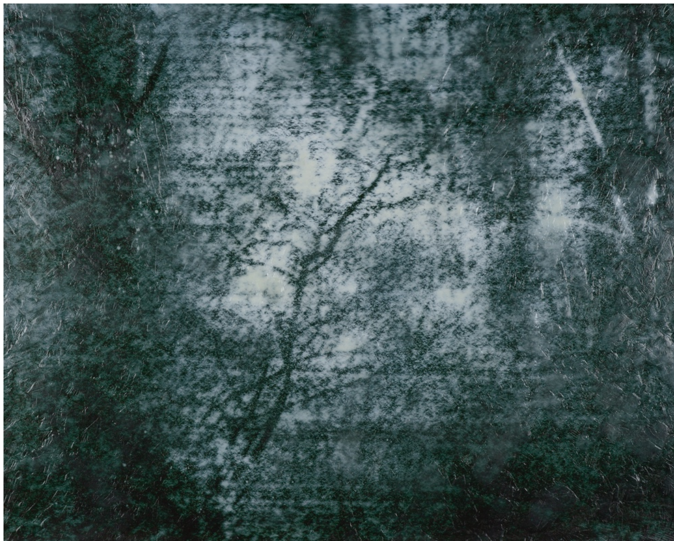
After the Wind No. 8

Ink, Watercolour, Wax on paper | 11 x 14 inches